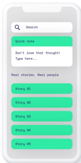
BUILD A COMMUNITY

CREATE DEEPER ENGAGEMENTS WITH YOUR CUSTOMERS AND EMPLOYEES BY EMPOWERING THEM TO SHARE THEIR EXPERIENCES WITH YOUR BRAND