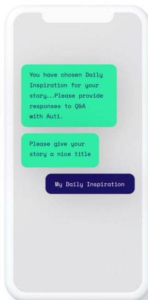
INSPIRE WITH OUR CHATBOT